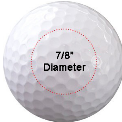
Red dotted line is max imprint area