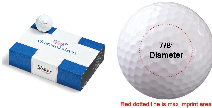
Red dotted line is max imprint area