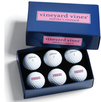
Shown with Foam