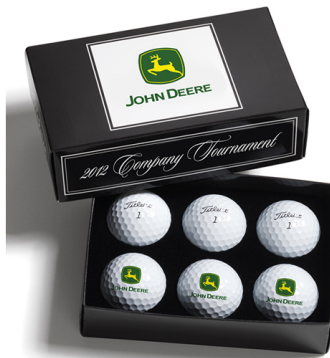
Shown with Foam