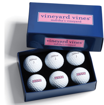
Shown with Foam