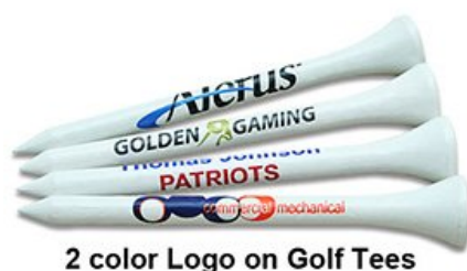
2 color Logo on Golf Tees