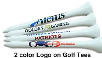
2 color Logo on Golf Tees