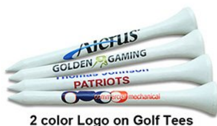
2 color Logo on Golf Tees