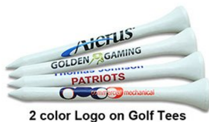
2 color Logo on Golf Tees