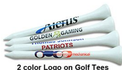
2 color Logo on Golf Tees